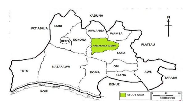
Fig. 2. Nasarawa State showing Nassarawa Eggon LGA

The climate of Nassarawa Eggon falls within the tropical savannah (Aw) climate with two clearly marked seasons, wet and dry. It has a mean temperature of 15.6 °C and 26.7 °C with an annual rainfall between 1317 mm and 1450 mm. 1t rains from April to October, and the months from December to February experience the north-east trade winds, and thus the dry Harmattan (NSG, 2001) winds. The onset of rains in April ushers in a noticeable decline in temperature. This continues in the cessation period, ending by October when a further decline is made possible in November/December by the coming of the Harmattan winds (Ayiwulu, 2012).