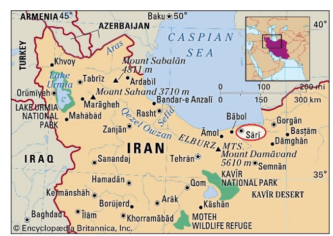
Figure 1. Sari city on the southern coast of the Caspian Sea (Britannica, 2018)

Sampling was performed in 2018, in February (winter) and April (spring) as the low and high tourist seasons, respectively. Sampling was done by taking a 24-hour composite sample of treated effluent (Sun et al., 2019). After 24 hours, a total of 270 liters (for each replicate) of effluent had passed through the sieve collection (37, 300 and 500 \mu m). The mesh sizes of the sieves were selected to separate the MP size classes and examine their numbers. In order to increase the accuracy of the estimate of the number of particles in the treated effluent, three replicate samples were taken on three consecutive days with the same weather conditions. The final results are based on the average of three repetitive samplings.