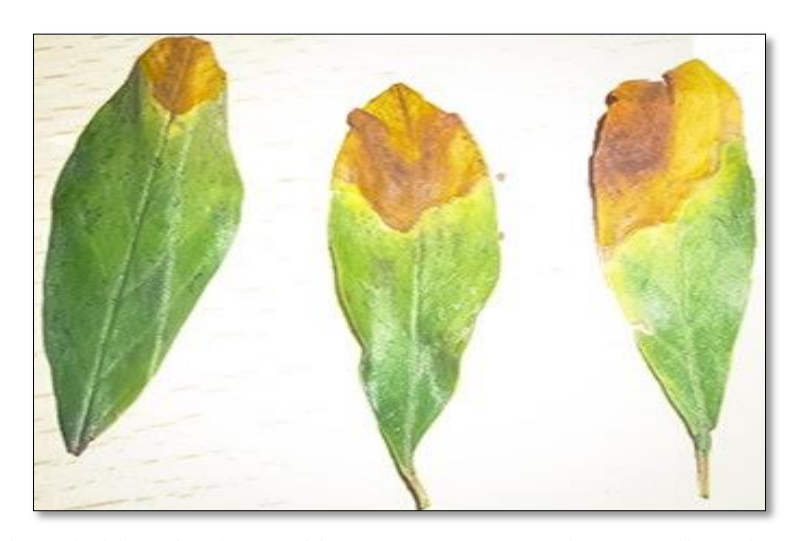
Figure 1. Necrosis and chlorosis observed in Punica granatum leaves collected around the industrial are of Gabes, Tunisia (Ben Amor et al., 2021).

Punica granatum .L is an important horticultural crop and is at the heart of oasis environment. It was classified as sensitive species to air pollution, which reduced their total chlorophyll content and relative water content (Ben Abdalah et al., 2006; Zouari et al., 2017; Ben Amor et al., 2021). Punica granatum .L leaves exposed to air contaminant, showed morphological damages such as necrosis and chlorosis (Fig.1) (Ben Amor et al., 2021).