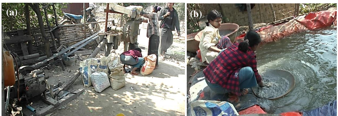
Fig 2. Ore crushing (a) and screening (b) process occurred in the yard. Ore crushing equipment, which is assembled from simple agricultural equipment, and reservoirs are distributed in courtyards with limited space. Among the people we interacted with, all family members who were able to work participated in ASGM activity for a household.

gender. During the refining process, ASGM workers directly inhale Hg vapor; furthermore, it diffuses to the surrounding environment, thereby polluting the environment and endangering public health.