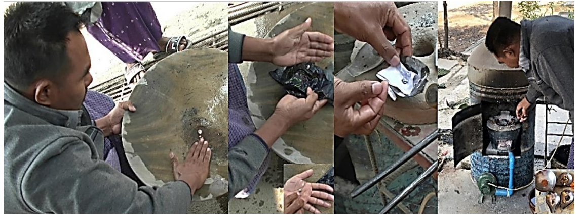
Fig 3. Gold refining process. This process took place on the street outside the gold shop. No protective attire, such as gloves or masks, were used during the whole process of amalgamation making and heating.