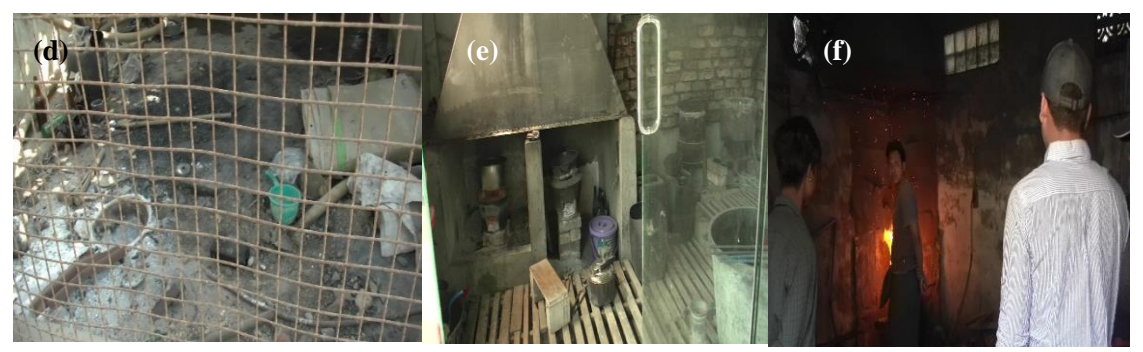
Fig 4. Gold refining location and the equipment inside the refining site. Refining sites were a) a designated location on the street, b) in front of the gold shop with a small furnace, and c) inside the gold shop with tall chimneys. Inside the refining site: d) open space with simple tools, e) a kitchen inside the gold shop next to the counter, f) a special room near the gold shop with certain ventilation equipment. Gold refining was conducted in open spaces or in relatively closed spaces, such as a room next to the counter or a special room outside, with some simple ventilation measures. Refining time generally ranges 1–10 hours/day. Hg vapor will diffuse into the surrounding environment directly or flow far away through the chimney (Palacios-Torres et al., 2018; Brown et al., 2020; Moody et al., 2020).

Plant samples were collected from tree bark, tree leaves, and grass in five locations during February 2020 in the ASGM area of Chaung Gyi Village Tract, where Hg was used for gold refining (Figure 1). One grass sample was collected as a control from the recycled water pond of the mining company EGC-MGPF Co. Ltd. in Wet Thay Village, where cyanide was used instead of Hg for gold refining. Tree bark and leaves were collected approximately 1.3–1.5 m above ground, while grass samples were collected from the ground. All samples were collected using gloves and stainless-steel tools, immediately packed in polyethylene bags, and subsequently dried in the outside natural environment for a simple preliminary drying. The dried samples were transported and preserved in the laboratory of the Research Institute for Humanity and Nature (RIHN), Kyoto, Japan, for future processing and analysis.