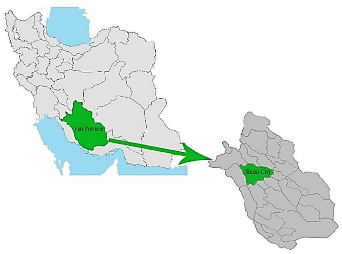
Fig. 1. The location of Fars province and Shiraz city

Shiraz city is the center of Fars province, located in the southern part of Iran (Fig. 1). The latitude and longitude of Shiraz are 29° 36' 37.12" *N and 52° 31' 52.07" E, respectively (Pasalari et al., 2019). Agriculture, tourism, and industry are the bases of the Shiraz economy. Shiraz climate is semi-arid (Azhdari et al., 2018). The waste management site is located 18 km south of Shiraz, near Maharlu Lake. The city has been a provincial business center for longer than two thousand years. In the last 50 years, the population has grown from 304,000 in 1969 to 1,628,000 in 2020 (Shiraly & Kokabi, 2019). This population growth and economic changes have caused many changes in the quality and quantity of Shiraz solid waste.