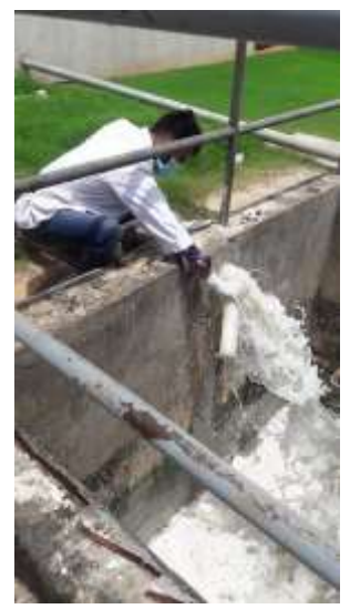
Fig 1: Sampling Site

Effluent Treatment Plant (ETP) indigenous to Jaipur Dairy, Rajasthan Co-operative Dairy Federation Limited (RCDF), Jaipur was selected for the planned study. Untreated Dairy Effluent (UDE) samples were collected (in triplicates) in pre-sterilized cans from inlet of ETP and stored under refrigerated conditions at 4°C until further analysis (APHA, 2005) (Figure 1). Inlet is a common raw effluent drainage point where wastewater generated by different unit processes in a dairy unit enters ETP (Porwal et al., 2015).