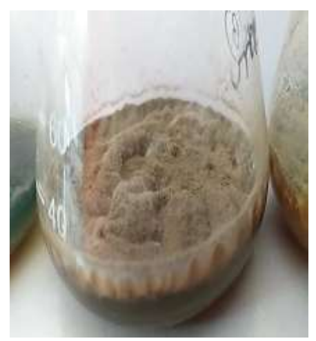
Fig 6: Submerged Fermentation

metabolism. Aspergillus niger GH1 has been explored for its biofficacy to degrade tannins under both SmF and Solid State Fermentation (SMF) (Jose Carlos et al., 2020).