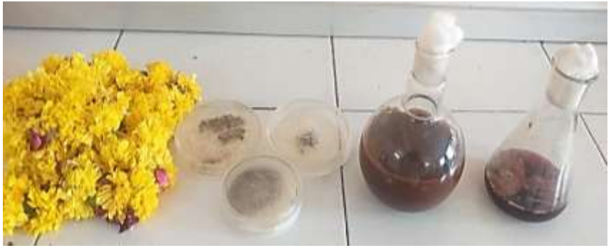
Fig 5: Pure culture of Aspergillus sp.

Qualitatively screening of the most promiscuous fungal isolate capable of reducing sulfate in UDE was characterized as Aspergillus sp. based on its cultural and staining characteristics (Figure 5). The role of Aspergillus niger , Mucor hiemalis and Galactomyces geotrichum in biodegradation of raw dairy effluent has been well established (Djelal & Amrane, 2013). Aerobically, yeast has been found to lower pollution indicators like BOD, Oil & Grease, turbidity and COD (Porwal et al., 2015). Bacteria mediated reduction of nitrate in dairy effluents has been reported previously owing their natural attenuation property (Sharma & Dwivedi, 2017).