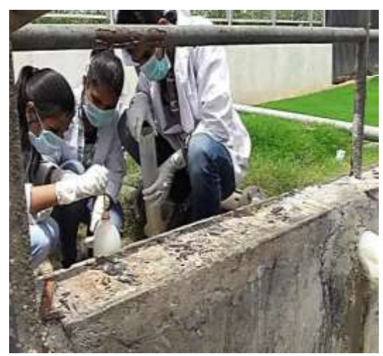
Fig 2: Site specific parameters

Site specific parameters like temperature, pH, odor and color were observed in accordance with standard procedures (Figure 2). For sulfate analysis, samples were collected, transported and processed (APHA, 2005) (Figure 3).