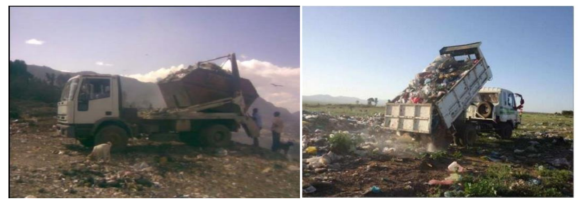
Fig. 3. Solid waste transportation and disposal to Bahir Dar transfer station via trucks

Sanitation, Beautification, and Parks Development Department (SBPDD) of municipality has set up the time schedule and fixed the vehicles for waste collection and transfer. Generally, collection vehicles such as dump trucks, normal trucks, open trucks, tipping trucks (container carriers), dislodging vacuum tankers with tractors, and power tillers with trolleys stay by the road close to the transfer station for operation. Staff workers are assigned with each vehicle to collect and dispose, though municipality does not have the required number of vehicles and staff to perform the task fully.