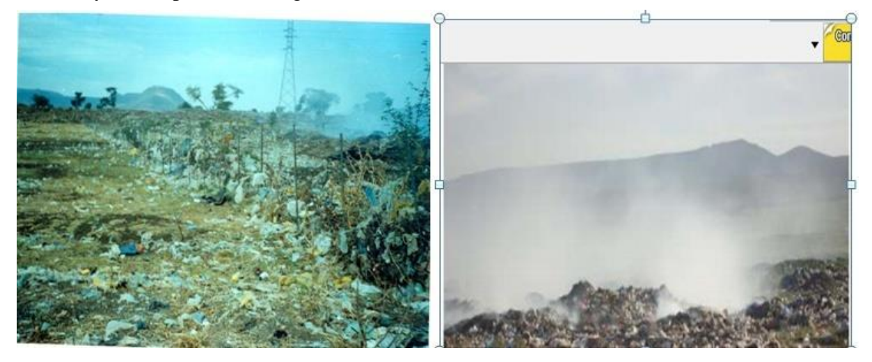
Fig. 4. Sebatamite municipal solid waste transfer station of Bahir Dar

In the disposal site, leachate may percolate and contaminate surface and ground water as this site is not designed for leachate containment protection. The sources of ground and surface water may be contaminated by these percolated wastes. People use this type of water for different purposes like bathing, washing, drinking, and farming. Also, contaminated water is harmful for fish and aquatic lives as the amount of dissolved oxygen in the water is reduced.