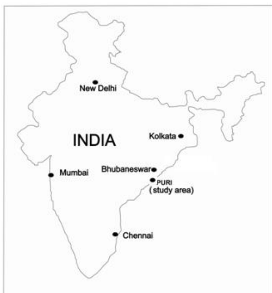
Fig. 1. Map of India showing the study area (Puri)

Noise levels were measured by means of Model LUTREN, SL-4010 and Model HD2110L sound level meters (De et al., 2017; Goswami, 2009; 2011; Goswami and Swain, 2011; Goswami et al., 2011; 2012a; 2012b; 2013; 2017; Goswami et al., 2013a; 2013b; Pradhan et al., 2012a; 2012b; Sahu et al., 2014; Swain and Goswami 2013a; 2013b; 2014a, 2014b; in press; Swain et al., 2012 a, 2012b; 2013; 2014; 2016; and Mohapatra and Goswami 2012a, 2012b). The equipment got calibrated in accordance with the recommended procedures of the manufacturers. The microphone of the sound level meter was installed 20cm away from the bus driver. Noise exposure level was nominally normalized to eight hours in a working day. The present study was conducted at Puri (Fig. 1) during May, 2014; May, 2015; and March, 2016. Puri is located at 19° 48' North Latitude and 85°52' East Longitude.