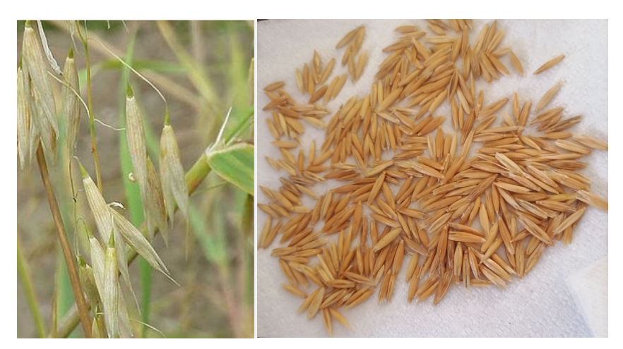
Fig. 1. Dry healthy oat seeds

address this concern, an experimental method of waste phytotesting on plant seeds was applied following SP 2.1.7.1386-03 "Sanitary rules for determining the hazard class of toxic production and consumption wastes" (Barral et al. 2011). This method involves using oat seeds as a model test plant, which has been found to provide stable and reproducible data compared to other crop seeds. Intact oat seeds with a germination rate of at least 95% were selected for the experiment, as depicted in Figure 1.