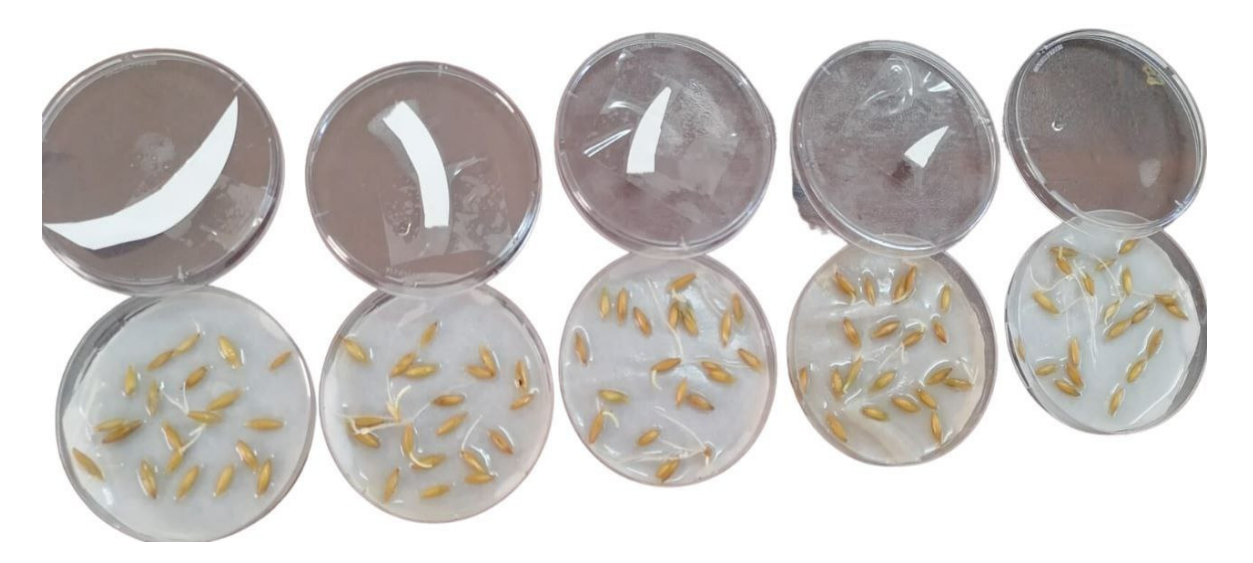
Fig. 2. Oat seeds in Petri dishes.

this period, the percentage of germinated seeds was calculated. In the experimental cups, 5 ml of rice straw extract was added, while the control seeds were treated with an appropriate amount of distilled water. All samples were kept in the thermostat for 7 days. At the end of the exposure period, the length of the roots of both the control and experimental seedlings was measured, with the longest root serving as the measurement criterion for each seed. Subsequently, the obtained experimental data underwent statistical processing. The phytotoxic effect was determined by comparing the parameters of the Lcp test function between the control and experimental seeds. The Lcp value was calculated as the arithmetic mean of the root length data for seedlings, according to formula (1) (Barral et al., 2011;SP 2.1.7.1386-03 ;Libralato et al., 2016).