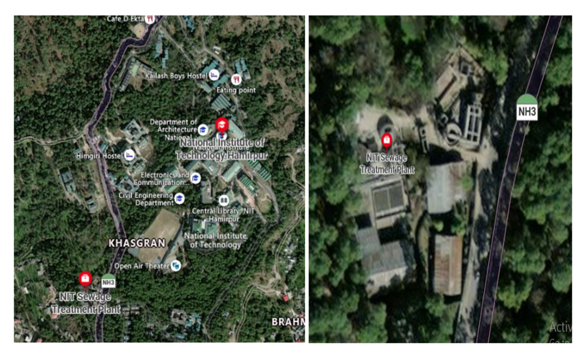
Fig. 2. Location of the study area