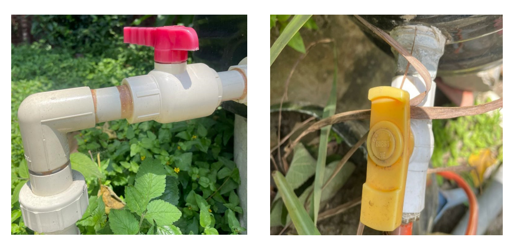
Fig. 4. a tap/flow regulator