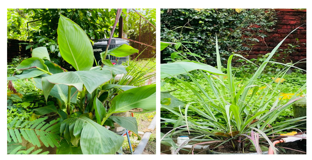
Fig. 5. photograph of the plant a. Canna Indica b. Lemon grass